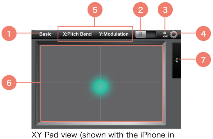
XY Pad view (shown with the iPhone in landscape orientation)